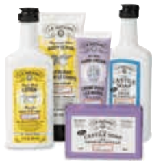
Body Care pages 10-17