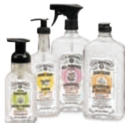
Home Care pages 18-21