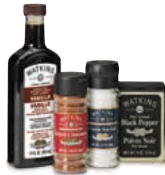
Gourmet pages 3-9

All of the above Points of Superiority make up THE WATKINS WAY, and you will agree that it is a good way.