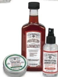
Remedies and Supplements pages 22-23