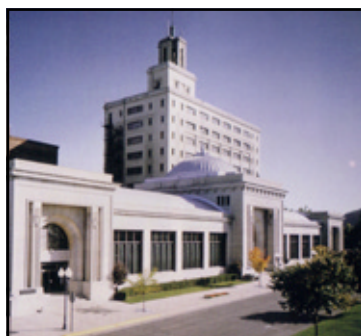
Watkins Headquarters and Factory in Winona, Minnesota