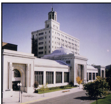
Watkins Headquarters and Factory in Winona, Minnesota