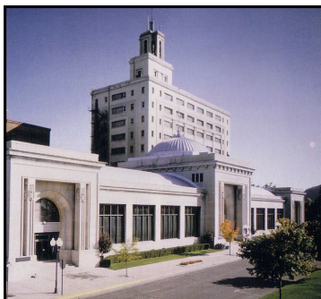
Watkins Headquarters and Factory in Winona, Minnesota

Watkins will reward you with potential profits and monthly bonuses if you help get more families using Watkins products instead of other brands. You can do that by selling products yourself and/or by helping bring other members to the business. And, of course, you can potentially get a nice discount on any Watkins products you want for yourself.